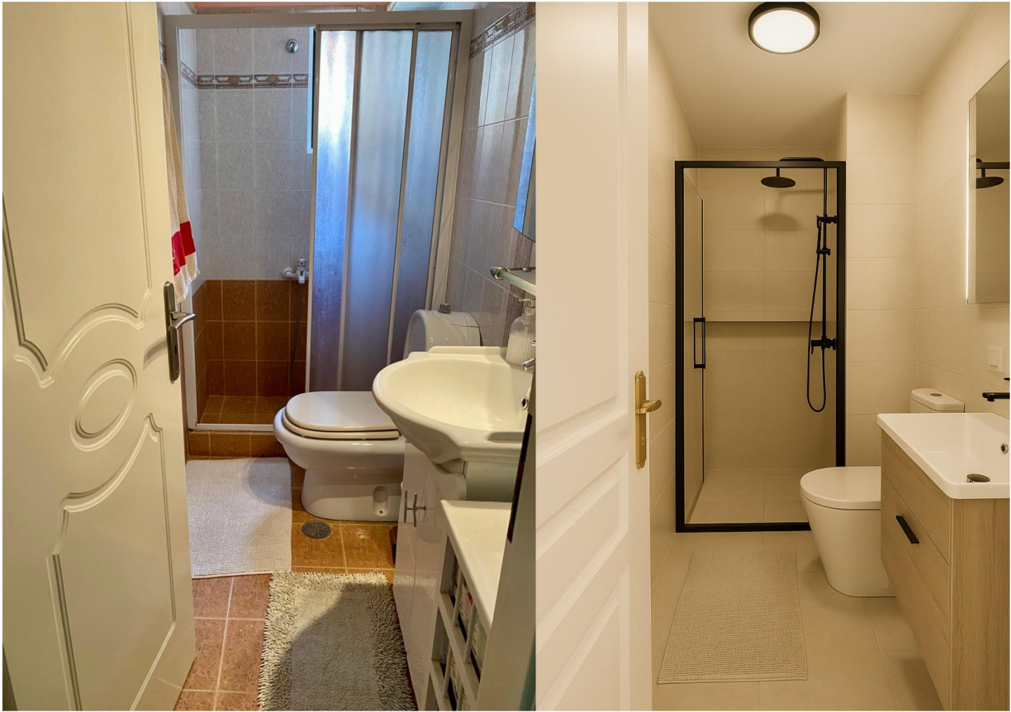
Before and After - Bathroom Renovation