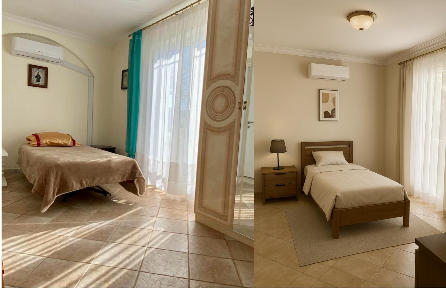
Before and After - Second Bedroom Transformation