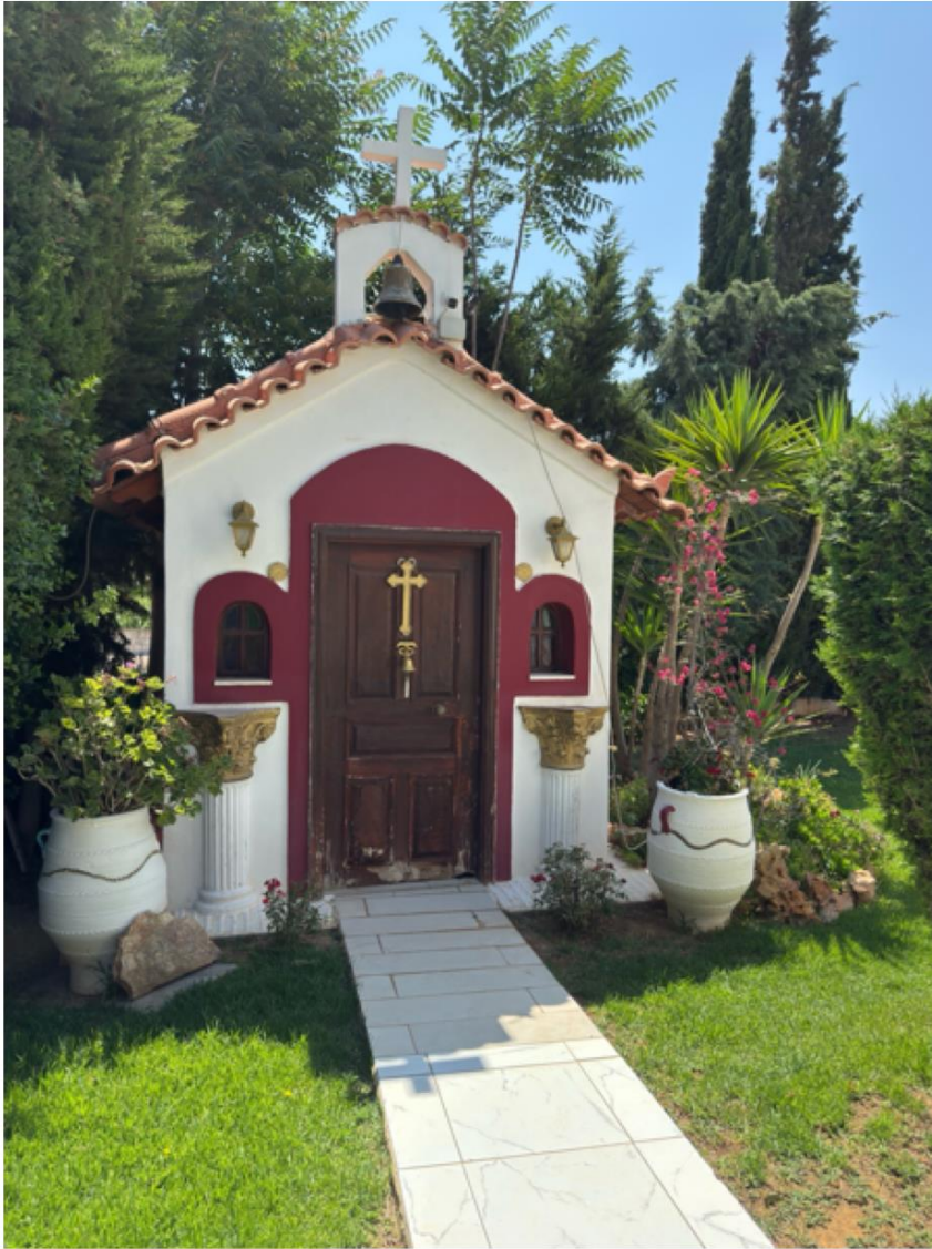
Before and After Renovation